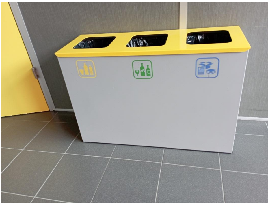
Indoor trash cans for sorted waste