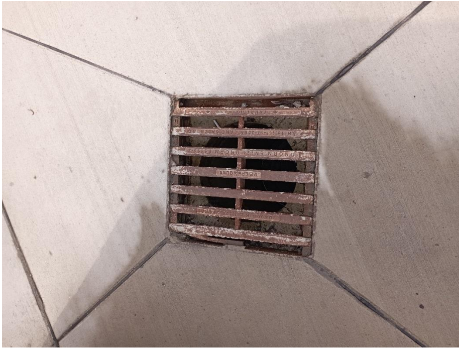
Surface water pipeline (drawn in detail in the construction project)