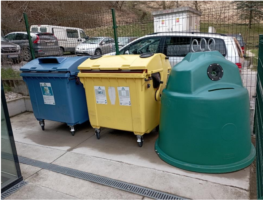
Large-capacity containers for separated waste