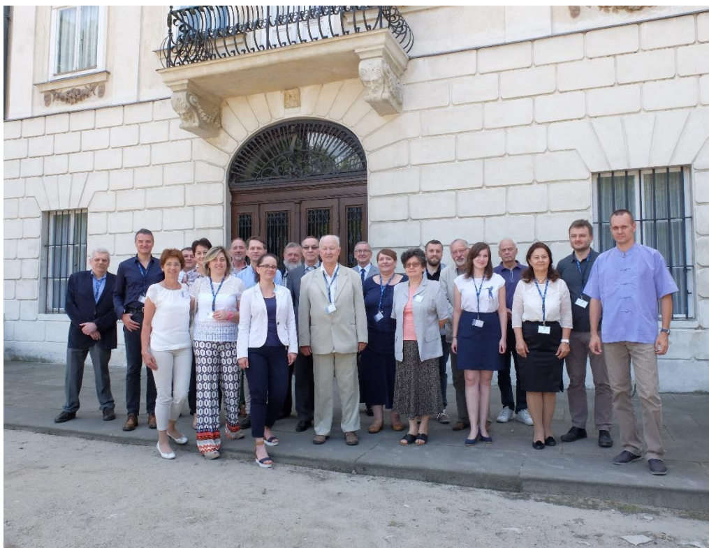
23 rd Conference Geometry-Graphics-Computer, Lodž 2016, Poland