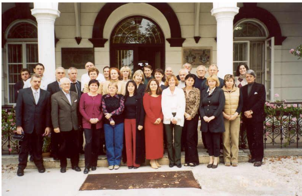
Symposium on Computer Geometry, SCG'2002, Kočovce