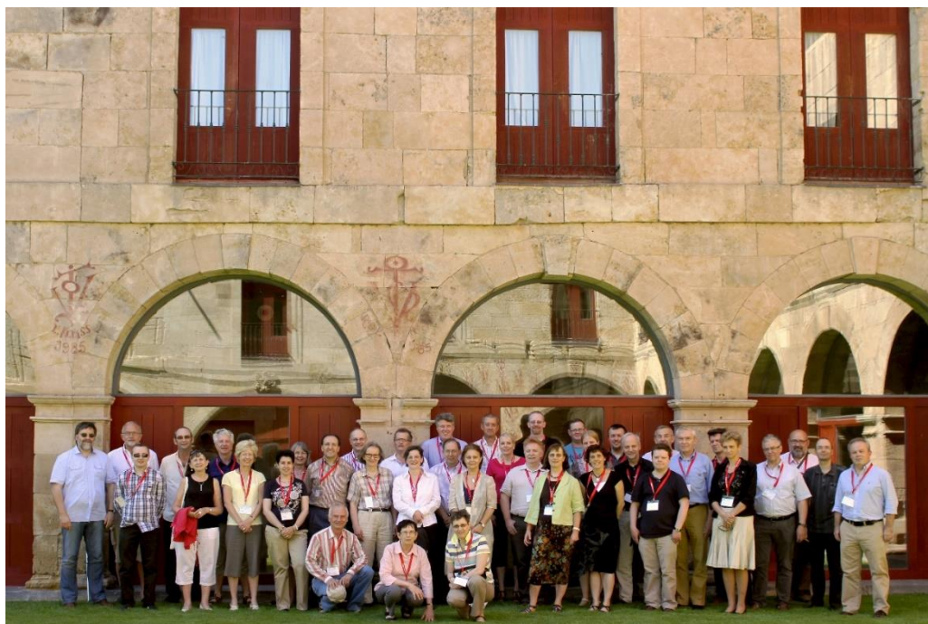
16 th SEFI MWG seminar, Mathematical Education of Engineers, Salamanca 2012, Spain