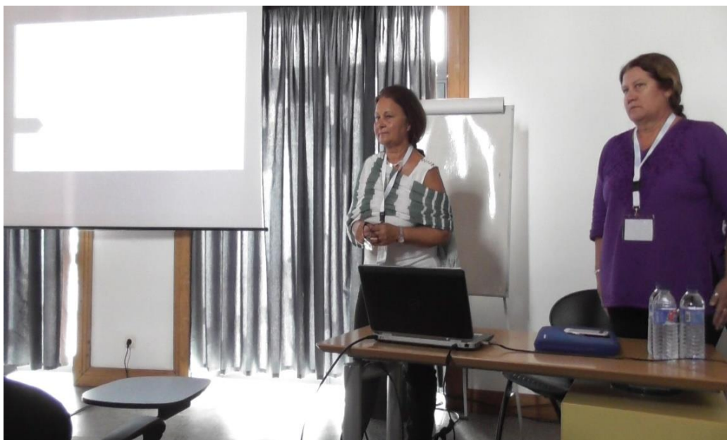
SEFI 2017 Annual Conference, Azore Islands, Spain