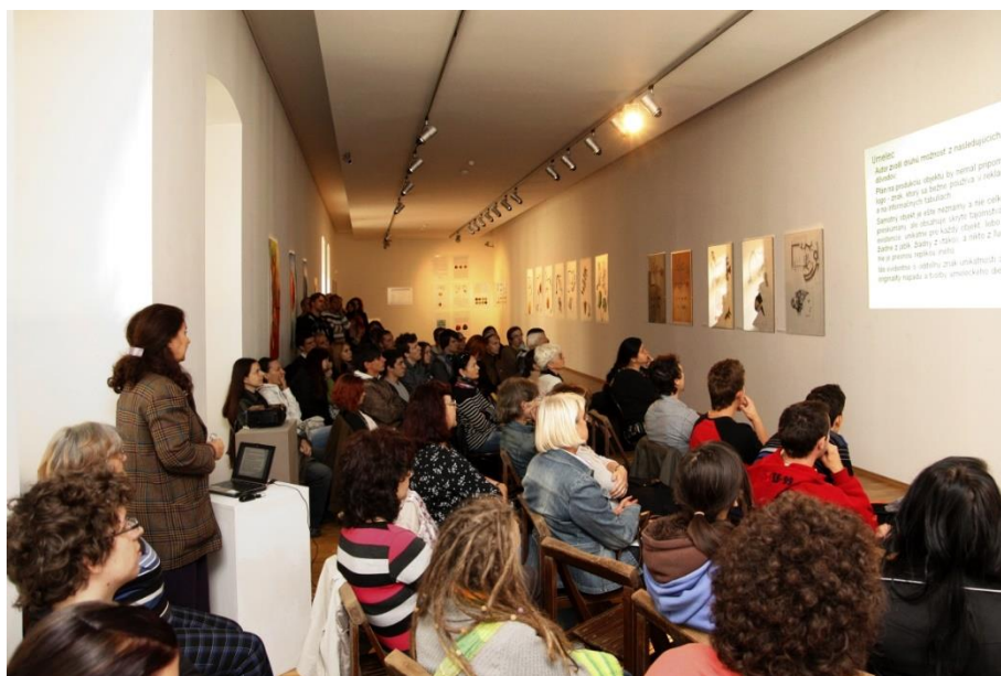
Projekty tvoriteľa, Východoslovenská galéria, Košice 2012, Výstava a prednáška "Matematicko-výtvarné riešenie tvorby"