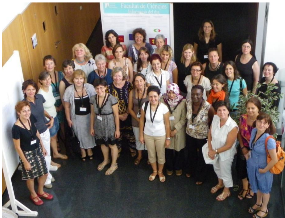
EWM conference - European Women in Mathematics, Barcelona 2011, Spain