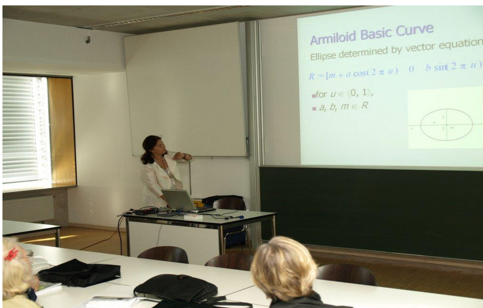
13 th International Conference on Geometry and Graphics, ICGG 2008, Dresden, Germany