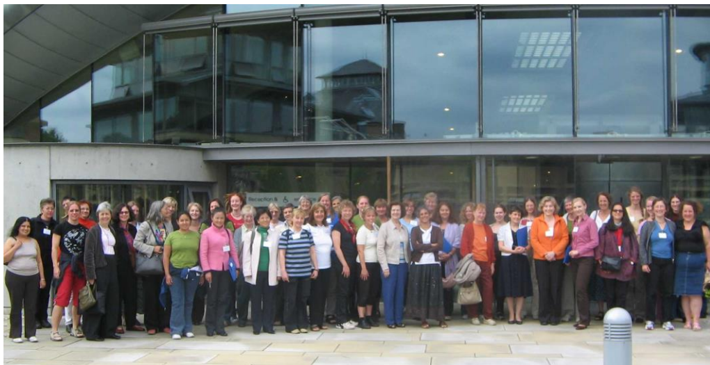
EWM conference - European Women in Mathematics 2007, Cambridge, UK