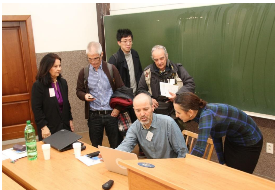
APLIMAT, 18 th Conference on Applied Mathematics, Sjf STU v Bratislave, 2019