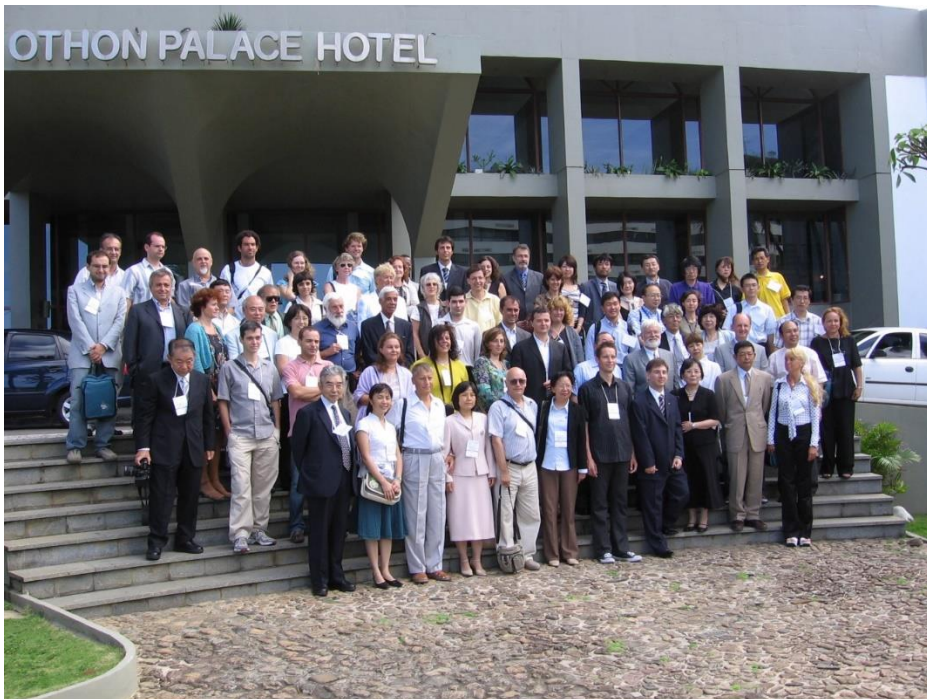
ICGG 2006, 12 th International Conference on Geometry and Graphics Salvador de Bahia, Brazil