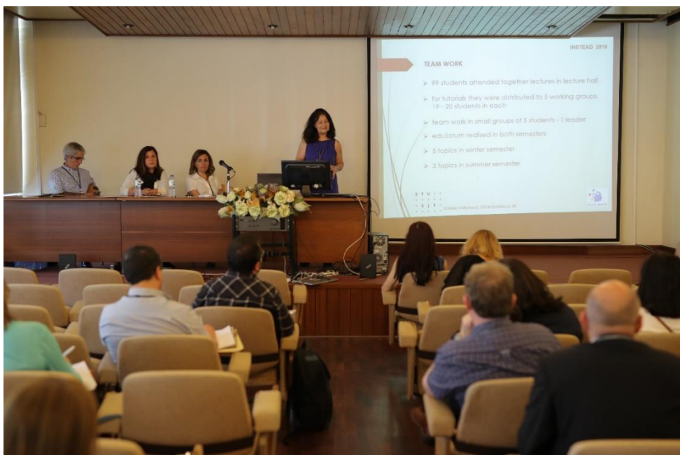
INSTEAD, the IV th Workshop on Innovative Teaching Methodologies for Math Courses on Engineering Degrees, ISEP Porto 2019, Portugal