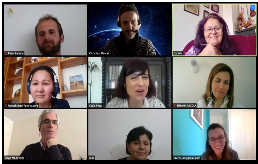
INSTEAD, the V th Workshop on Innovative Teaching Methodologies for Math Courses on Engineering Degrees, video conference, TU Chemnitz 2020, Germany