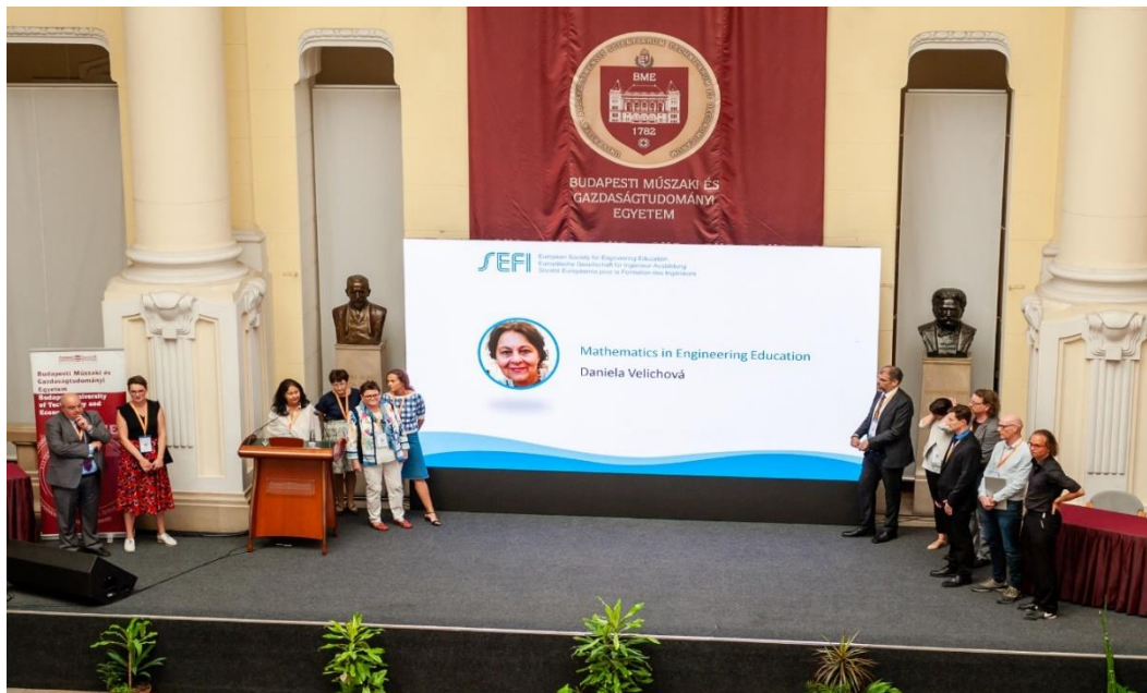
SEFI 2019 Annual Conference, TU Budapešť, Hungary