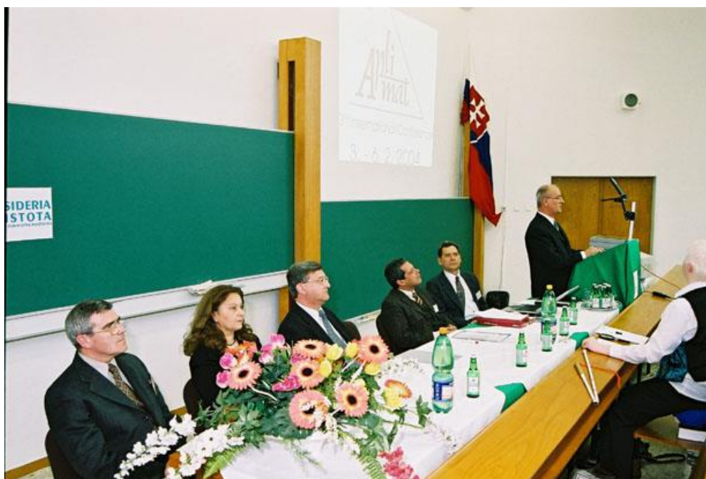
Konferencia Aplimat 2004 , Bratislava