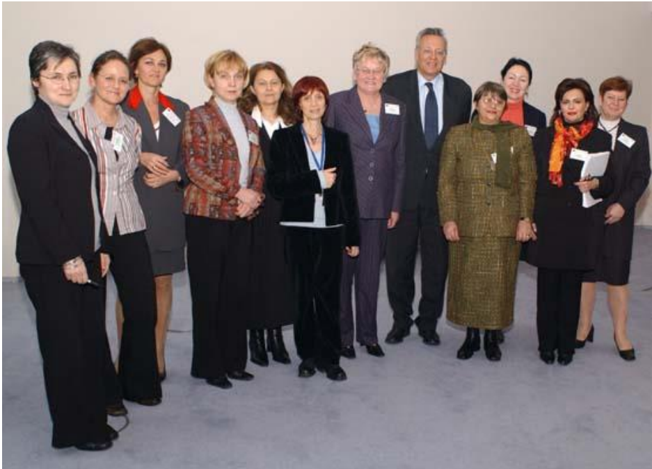
Enwise Valorisation Conference, Tallinn 2004, Estonia