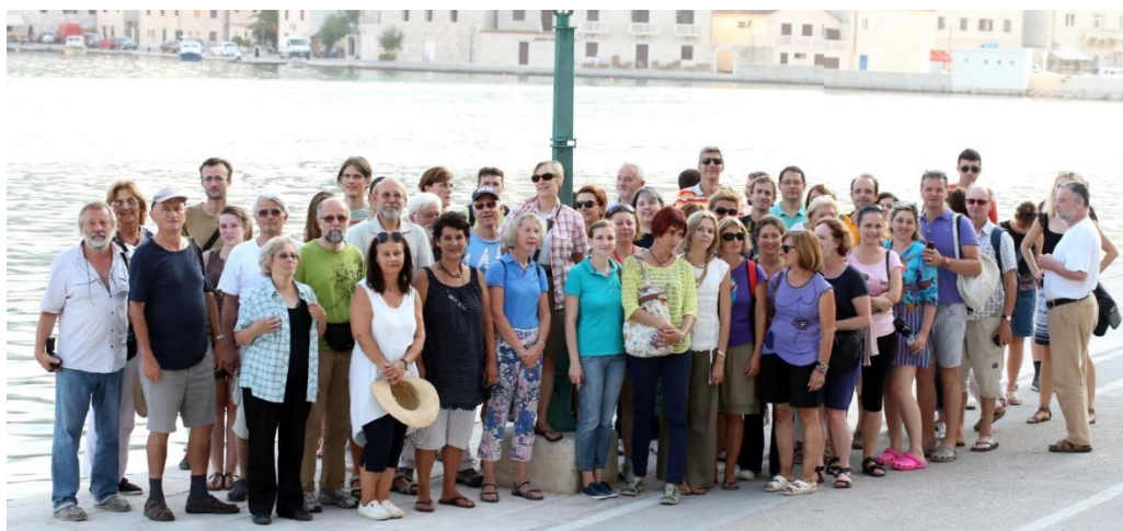
4 th Conference on Geometry and Graphics, Supetar, Brač 2014, Croatia